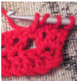
Step 4: yo and draw through (4 loops on hook)