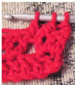
Step 5: yo, draw through two loops (3 loops on hook)