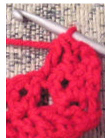
Step 6: yo, draw through all three loops - Inverted V-stitch completed!