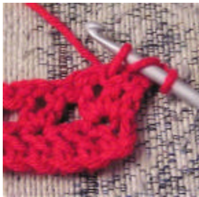
Step 1: YO, insert hook under both loops of first leg of first V-stitch on previous row, yo, pull through (3 loops on hook)

Now on to the Inverted-V-Stitch . This is a bit more work. ☺ We will work an inverted V into an existing V. Chain 2 for height