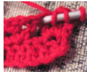
Step 3: yo, insert hook in second leg of V-stitch from previous row