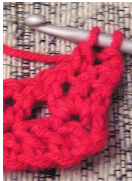
Step 2: yo, draw through 2 loops (2 loops on hook)